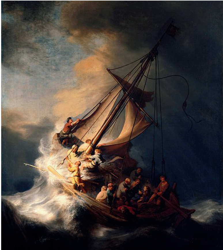
Rembrandt (1606–1669), The Storm on the Sea of Galilee

Alleluia, alleluia! A great prophet has appeared among us; God has visited his people. Alleluia!