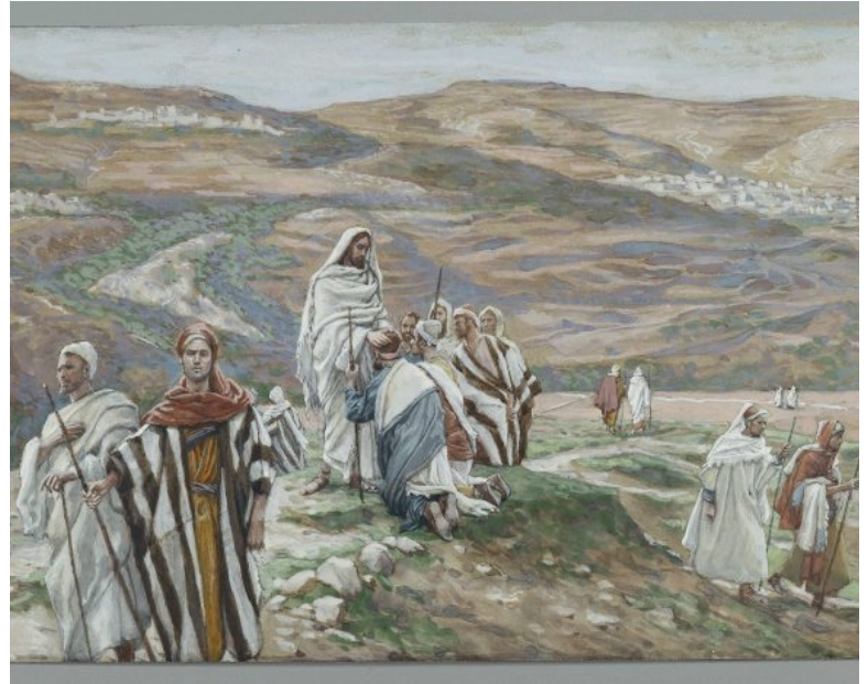
James Tissot (1836-1902), He Sent them out Two by Two

And it is in him that we are claimed as God's own, chosen from the beginning, under the predetermined plan of the one who guides all things as he decides by his own will; chosen to be, for his greater glory, the people who would put their hopes in Christ before he came. Now you too, in him, have heard the message of the truth and the good news of your salvation, and have believed it: and you too have been stamped with the seal of the Holy Spirit of the Promise, the pledge of our inheritance which brings freedom for those whom God has taken for his own, to make his glory praised.