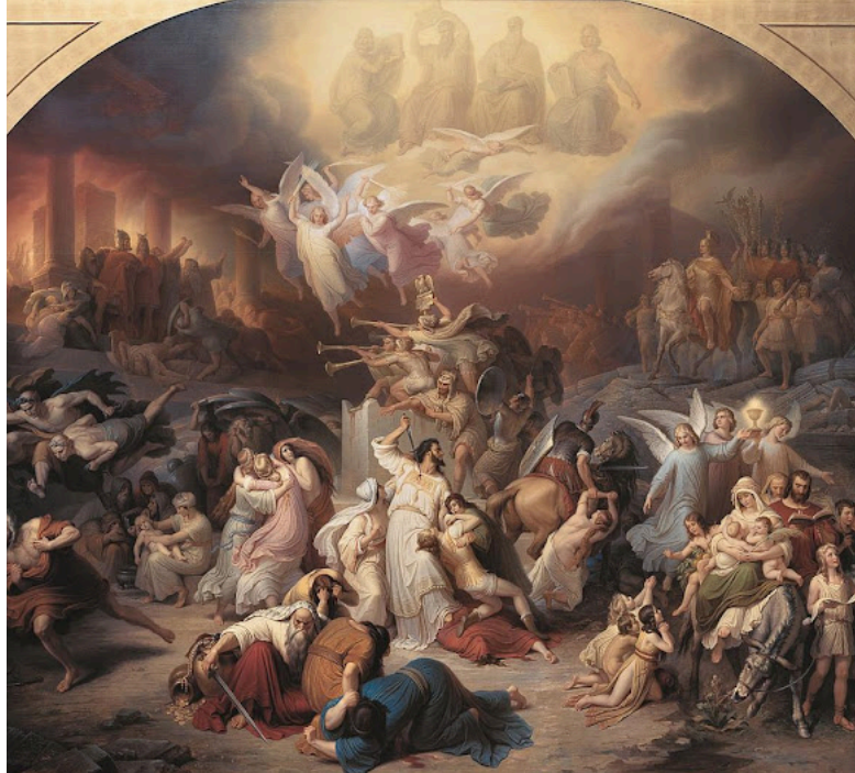
Wilhelm von Kaulbach (1805–1874), The Destruction of Jerusalem by Titus

Alleluia, alleluia! Lord, show us your mercy and love, and grant us your salvation. Alleluia!