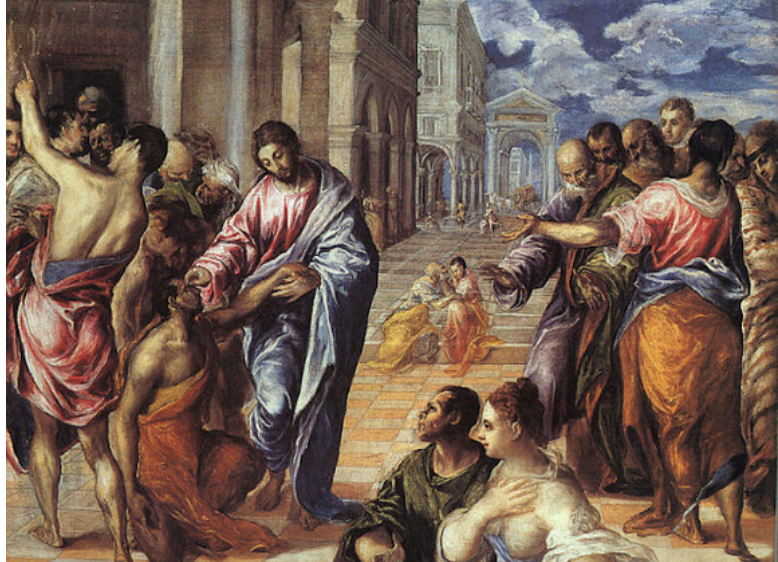
El Greco (1541–1614). Painted in the 1570s, Christ Healing the Blind

Every high priest has been taken out of mankind and is appointed to act for men in their relations with God, to offer gifts and sacrifices for sins; and so he can sympathise with those who are ignorant or uncertain because he too lives in the limitations of weakness. That is why he has to make sin offerings for himself as well as his people. No one takes this honour on himself, but each one is called by God, as Aaron was. Nor did Christ give himself the glory of becoming high priest, but he had it from the one who said to him: You are my son, today I have become your father, and in another text: You are a priest of the order of Melchizedek, and for ever.