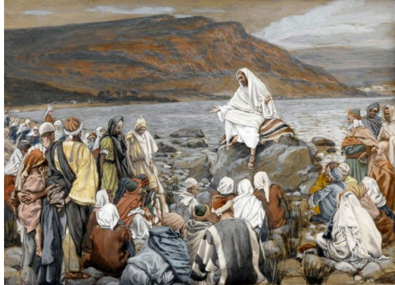
James Tissot (1836-1902), Jesus Teaches the People by the Sea

Then there used to be a great number of those other priests, because death put an end to each one of them; but this one, because he remains for ever, can never lose his priesthood. It follows, then, that his power to save is utterly certain, since he is living for ever to intercede for all who come to God through him. To suit us, the ideal high priest would have to be holy, innocent and uncontaminated, beyond the influence of sinners, and raised above the heavens; one who would not need to offer sacrifices every day, as the other high priests do for their own sins and for those of the people, because he has done this once and for all by offering himself. The Law appoints high priests who are men subject to weakness; but the promise on oath, which came after the Law, appointed the Son who is made perfect for ever.