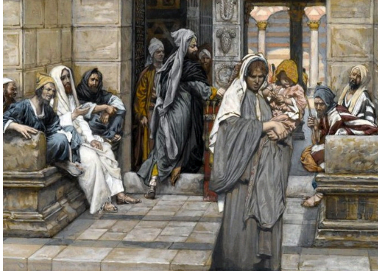
James Tissot (1836-1902), The Widow's Mite

It is not as though Christ had entered a man-made sanctuary which was only modelled on the real one; but it was heaven itself, so that he could appear in the actual presence of God on our behalf. And he does not have to offer himself again and again, like the high priest going into the sanctuary year after year with the blood that is not his own, or else he would have to suffer over and over again since the world began. Instead of that, he has made his appearance once and for all, now at the end of the last age, to do away with sin by sacrificing himself. Since men