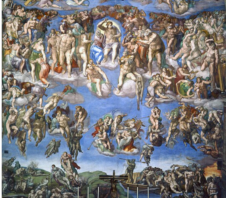
Michelangelo (1475–1564), The Last Judgement

Alleluia, alleluia! Be watchful, pray constantly, that you may be worthy to stand before the Son of Man. Alleluia!