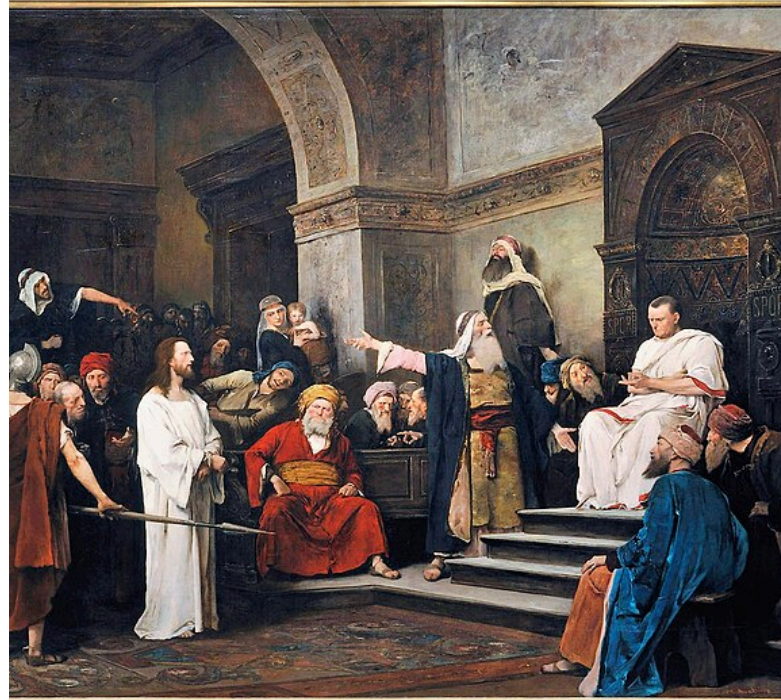
Mihály Munkácsy (1844-1900), Christ Before Pilate

Alleluia, alleluia! Blessed is he who inherits the kingdom of David our Father; blessed is he who comes in the name of the Lord. Alleluia!