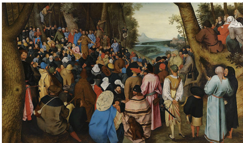
Pieter Brueghel the Younger (1564–1638), The Sermon of Saint John the Baptist

Alleluia, alleluia! The Spirit of the Lord is upon me; he sent me to bring Good News to the poor. Alleluia!