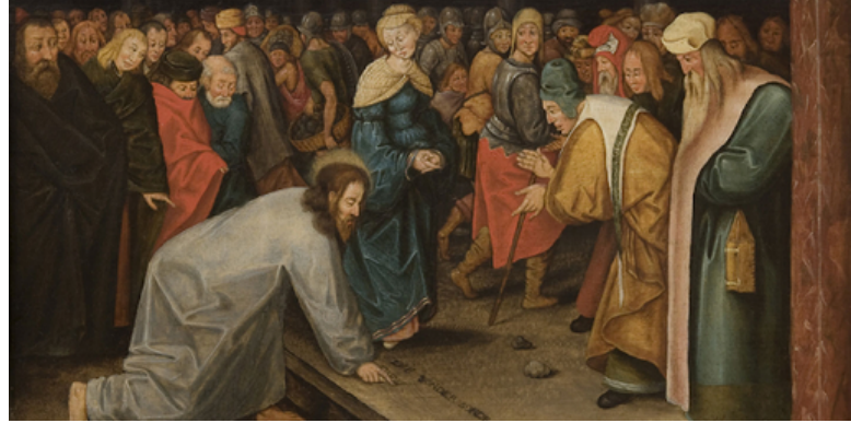
Pieter Bruegel the Younger (1564-1638), Christ and the Adulteress

Glory to you, Word of God, Lord Jesus Christ! With all your heart turn to me, for I am tender and compassionate. Glory to you, Word of God, Lord Jesus Christ!