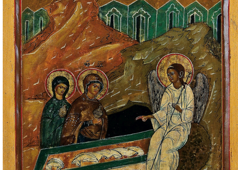
Anonymous (17 th century), Icon of Women at the grave

Since you have been brought back to true life with Christ, you must look for the things that are in heaven, where Christ is, sitting at God's right hand. Let your thoughts be on heavenly things, not on the things that are on the earth, because you have died, and now the life you have is hidden with Christ in God. But when Christ is revealed - and he is your life - you too will be revealed in all your glory with him.