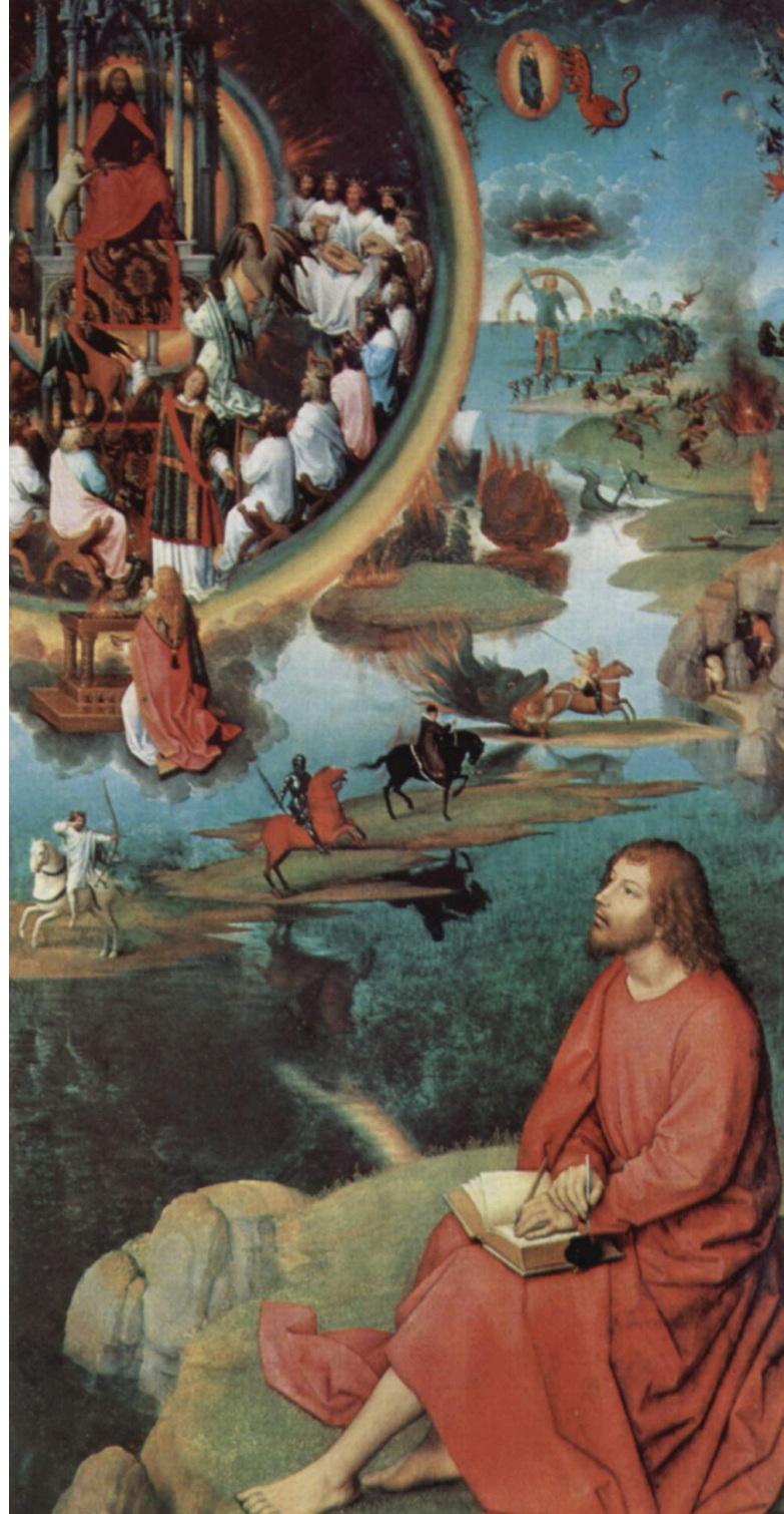
Hans Memling (~1433–1494), John the Evangelist on Patmos and visions of the apocalypse

Alleluia, alleluia! I give you a new commandment: love one another as I have loved you. Alleluia!