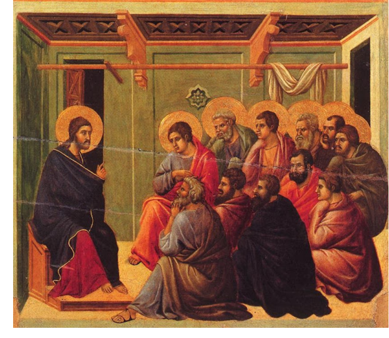
Duccio (1260–1318), Christ Taking Leave of the Apostles

SECOND READING In the spirit, the angel took me to the top of an enormous high mountain and showed me Jerusalem, the holy city, coming down from God out of heaven. It had all the radiant glory of God and glittered like some precious jewel of crystal-clear diamond. The walls of it were of a great height, and had twelve gates; at each of the twelve gates there was an angel, and over the gates were written the names of the twelve tribes of Israel; on the east there were three gates, on the north three gates. The city walls