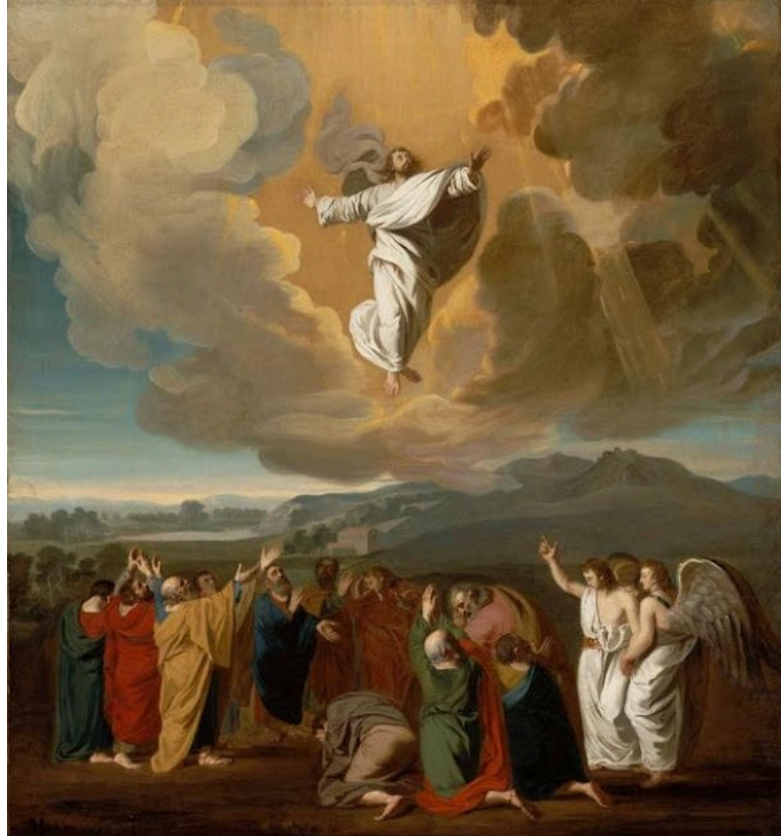
John Singleton Copley (1738–1815), Jesus Ascending to Heaven

It is not as though Christ had entered a man-made sanctuary which was only modelled on the real one; but it was heaven itself, so that he could appear in the actual presence of God on our behalf. And he does not have to offer himself again and again, like the high priest going into the sanctuary year after year with the blood that is not his own, or else he would have to suffer over and over again since the world began. Instead of that, he has made his appearance once and for all, now at the end of the last age, to do away with sin by sacrificing himself. Since men only die once, and after that comes judgment, so Christ, too, offers himself only once to take the faults of many on himself, and when he appears a second time, it will not be to deal with sin but to reward with salvation those who