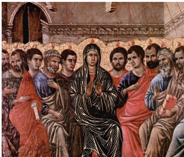
Duccio, di Buoninsegna (1319), Pentecost - Panel from the Maesta Altarpiece of Siena

Everyone moved by the Spirit is a son of God. The spirit you received is not the spirit of slaves bringing fear into your lives again; it is the spirit of sons, and it makes us cry out, 'Abba, Father!' The Spirit himself and our spirit bear united witness that we are children of God. And if we are children we are heirs as well: heirs of God and coheirs with Christ, sharing his sufferings so as to share his glory.