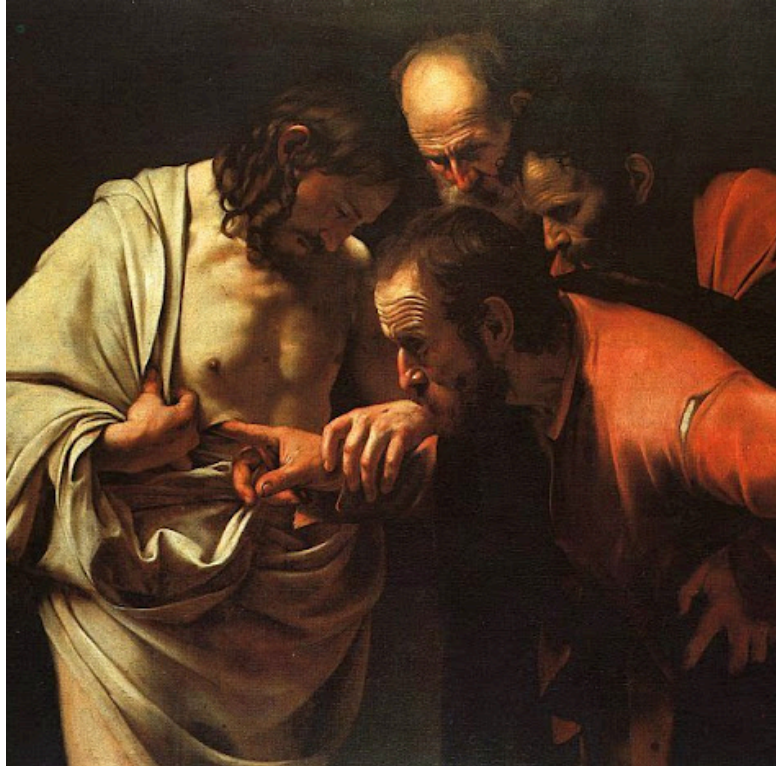
Michelangelo Merisi da Caravaggio (1571-1610). The Incredulity of Saint Thomas by Caravaggio.

Alleluia, alleluia! You believe in me, Thomas, because you have seen me; happy those who have not seen me, but still believe! Alleluia!