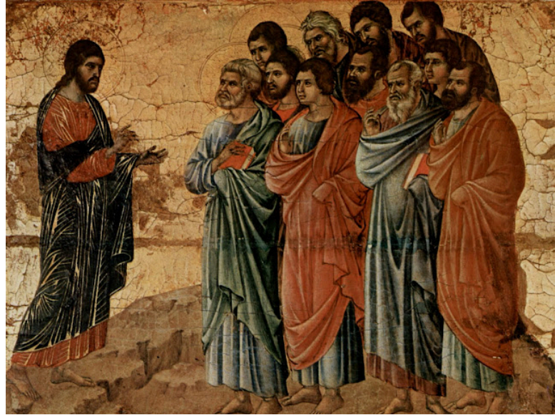
Duccio di Buoninsegna (1260-1318). Jesus appears to the disciples.

Alleluia, alleluia! I am the way, the truth, and the life, says the Lord; no one comes to the Father, except through me. Alleluia!