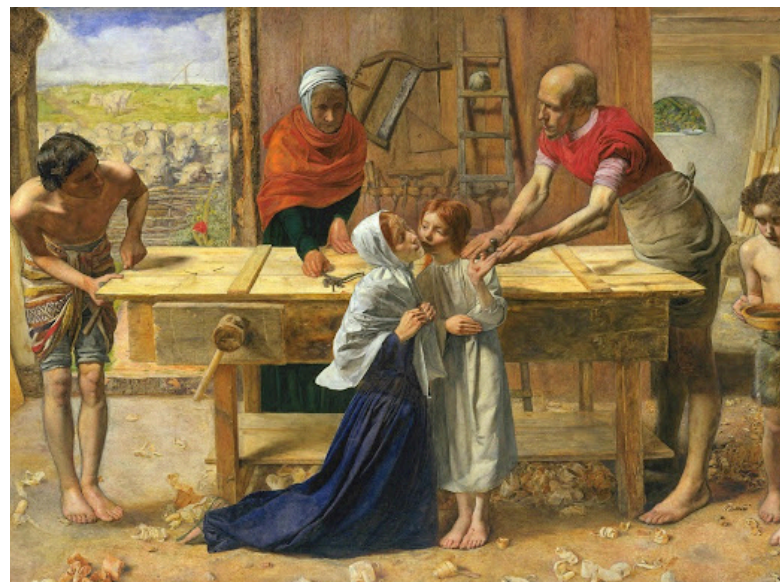
John Everett Millais (1829–1896). Christ in the House of His Parents (The Carpenter's Shop).

Alleluia, alleluia! All who love me will keep my words, and my Father will love them, and we will come to them. Alleluia!