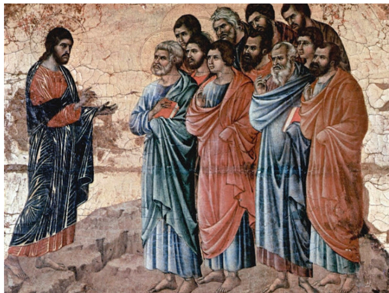
Duccio, di Buoninsegna, (1319). Christ Appears to the Disciples on the Mountain in Galilee.

May the God of our Lord Jesus Christ, the Father of glory, give you a spirit of wisdom and perception of what is revealed, to bring you to full knowledge of him. May he enlighten the eyes of your mind so that you can see what hope his call holds for you, what rich glories he has promised the saints will inherit and how infinitely great is the power that he has exercised for us believers. This you can tell from the strength of his power at work in Christ, when he used it to raise him from the dead and to make him sit at his right hand, in heaven, far above every Sovereignty, Authority, Power, or Domination, or any other name that can be named, not only in this age but also in the age to come. He has put all things under his feet, and made him, as the ruler of everything, the head of the Church; which is his body, the fullness of him who fills the whole creation.