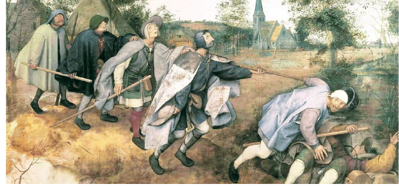
Pieter Bruegel the Elder (1568), The Blind Leading the Blind

Alleluia, alleluia! Shine on the world like bright stars; you are offering it the word of life. Alleluia!